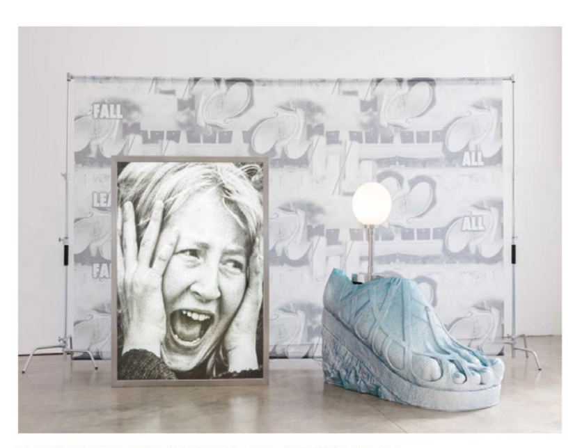
Guan Xiao: 'Flattened Metal', 2016. ICA London.

In a nutshell: 21 incredible contemporary art galleries from as far afield as New York, Berlin and São Paolo are taking up month-long residence at 15 of London's best young galleries. The guest gets a place to exhibit in London. The host gets to show their own artists' work alongside them. It's a massive art party, it's a festival, an art fair: it's essentially Match.com for the international gallery scene, and we get to watch all the canoodling (in a non-creepy way. Obviously). And after a highly successful debut in 2016, it's now doubled in size, so there's even more to see.